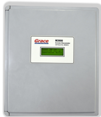
M3900 Control Box